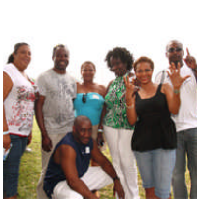
Class of 1981