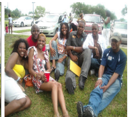
NY crew "relaxing" with the Principal