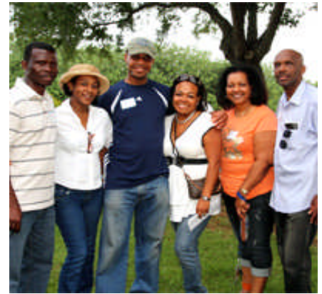
Class of 1976