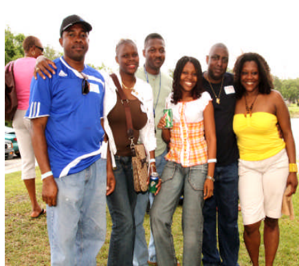
Class of 1988