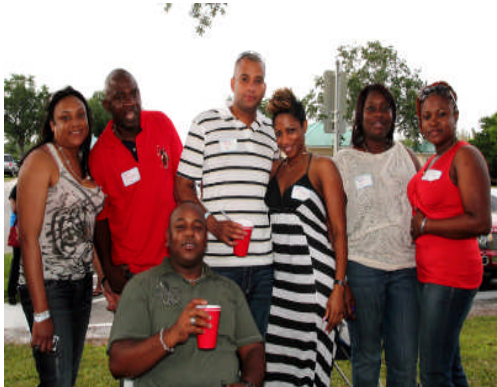
Class of 1991