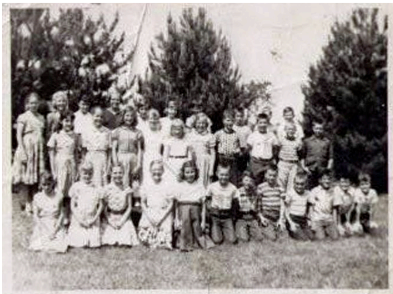
Clarksville Fifth Grade, 1956-57