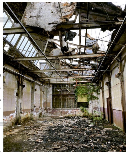
This interior view, and the front page photo, were provided by Costello Dismantling.

He also said then that "Today we can transition to cleaning up this site for the health and safety of our community and also for the economic opportunity this iconic property will once again represent for Springfield and for the state of Vermont."