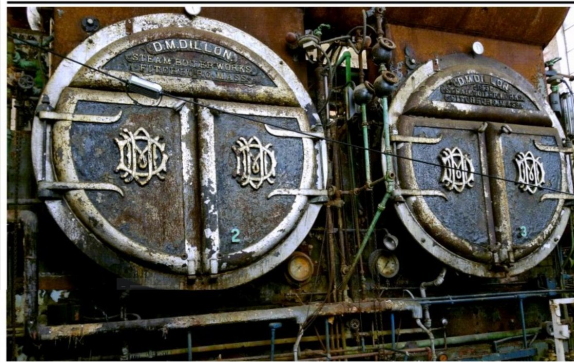
One of the boilers in the Boiler House, which is being demolished, may be the last photo of these (installed in 1931) before they are dismantled and disposed of in the next few weeks.