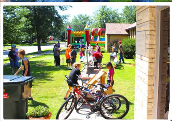
Sidewalk Spirit Blast - 2014