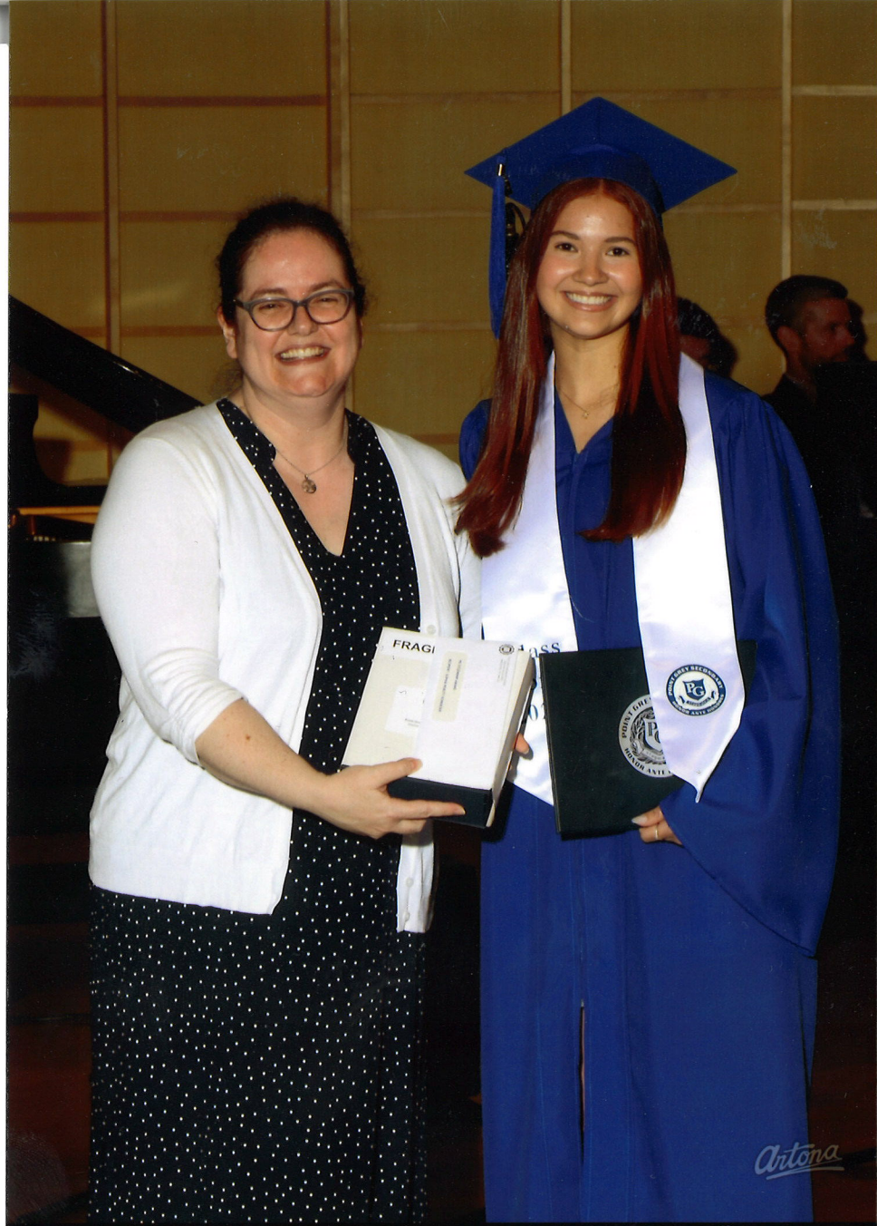
POINT GREY SECONDARY SCHOOL 2024