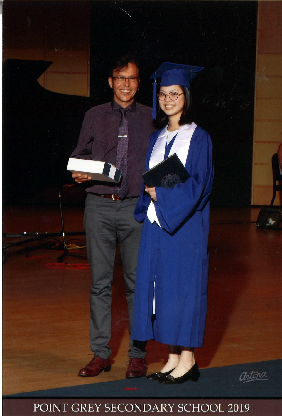
POINT GREY SECONDARY SCHOOL 2019