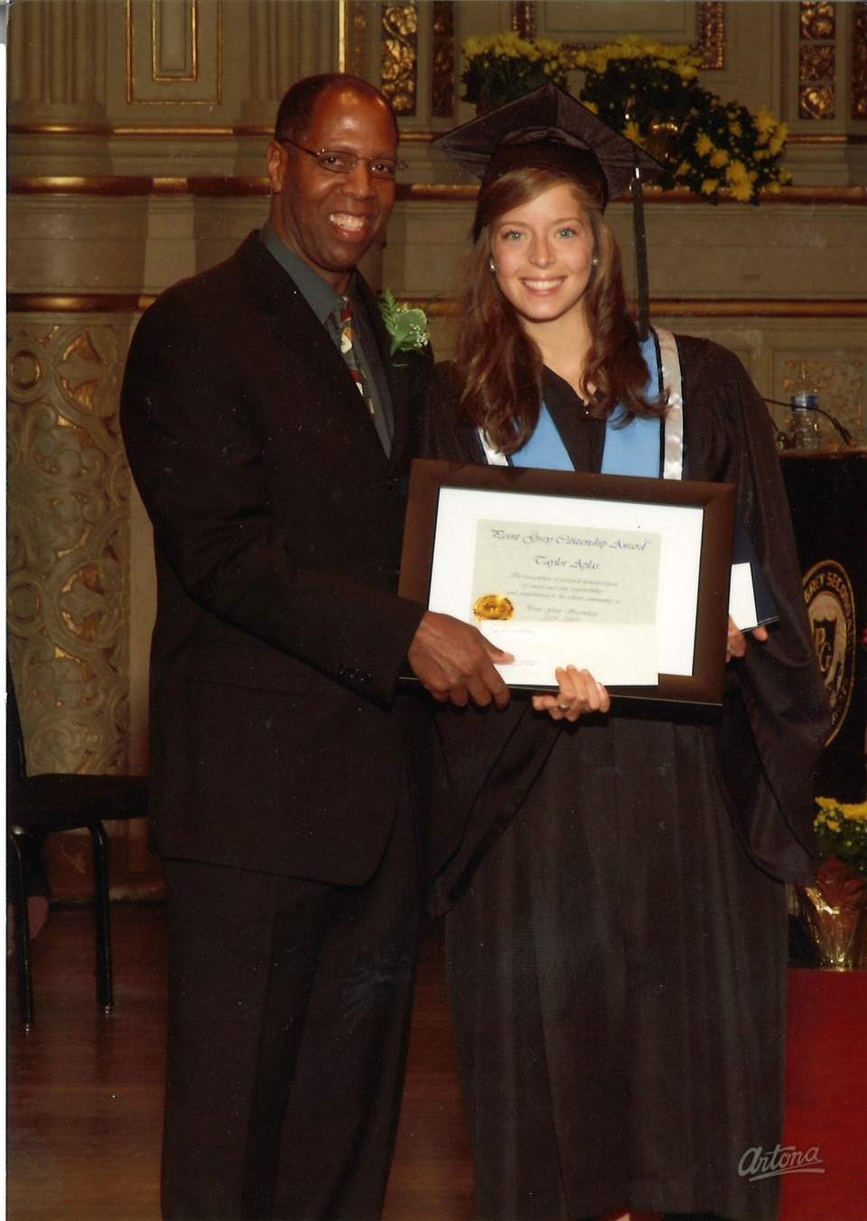
POINT GREY SECONDARY SCHOOL CONVOCATION 2010