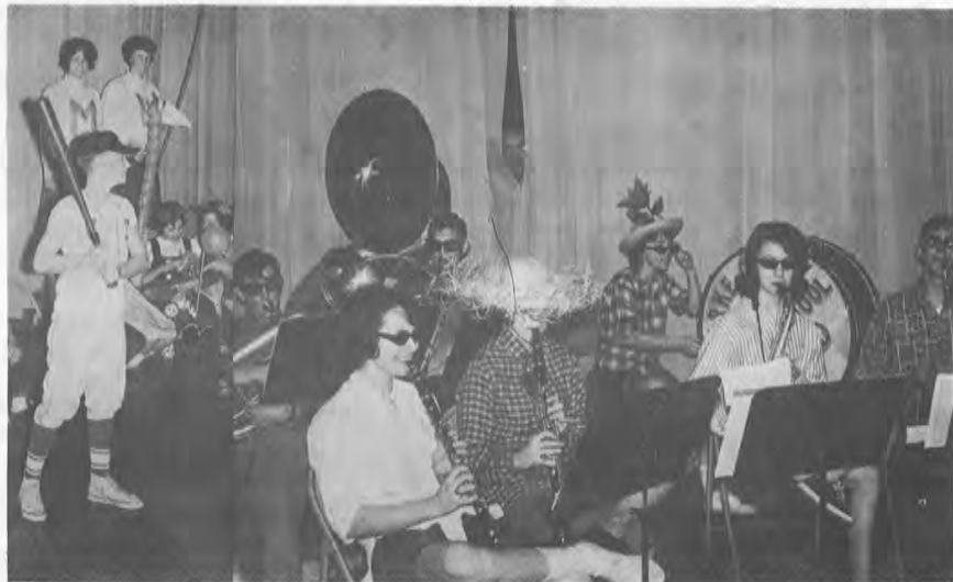
Pictured above are scenes from the twelfth and eighth grade skits. Below are portions from the eleventh, ninth and tenth grade skits.

ed to keep you laughing from the opening line to the closing curtain.