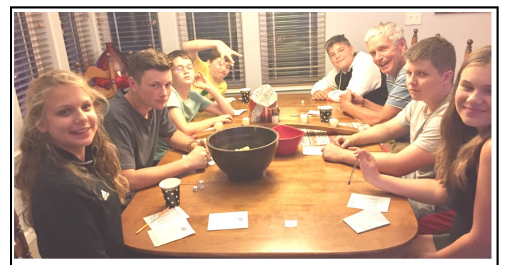
Sundae's and Bunko Party