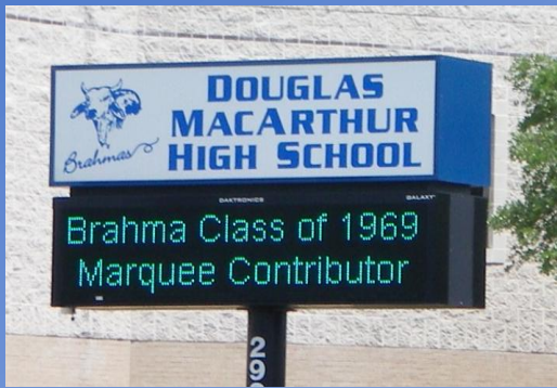
Class of '69 honored on new Marquee

As of Spring Break 2010, MacArthur High School has an operating information display sign visible from Bitters Road.