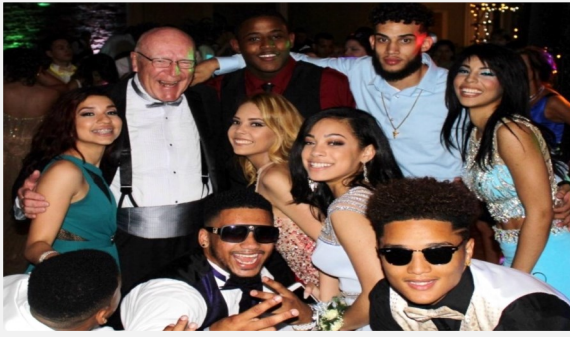
2016 Senior Prom