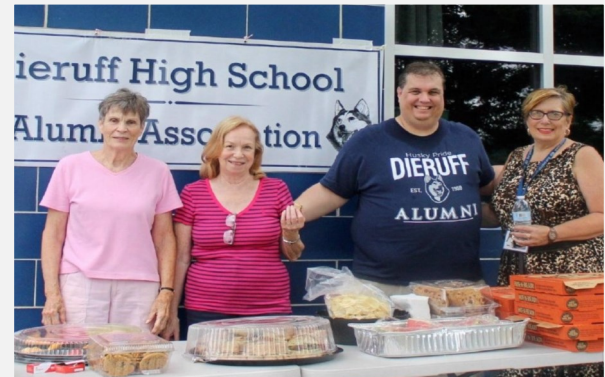
DHS Band Preview Pizza Party