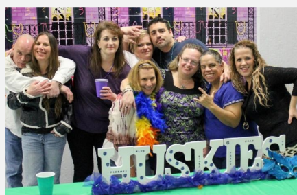
5th Annual Mardi Gras