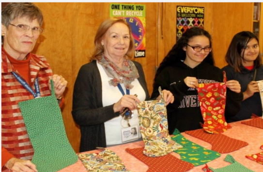
Sew What Club: Stockings For Soldiers