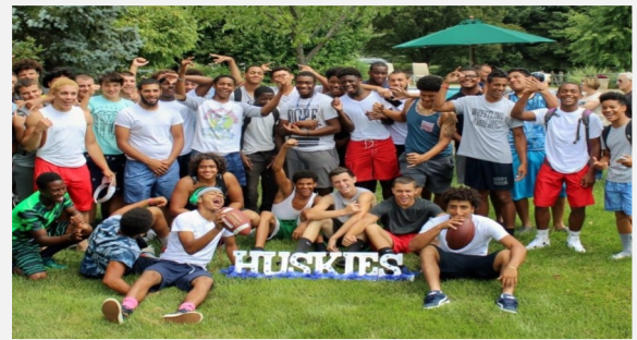
Annual Football Team Swim Party