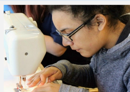
Sew What? Club