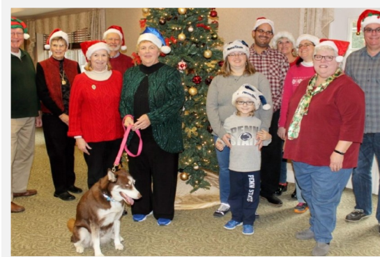
Alumni Choir Caroling