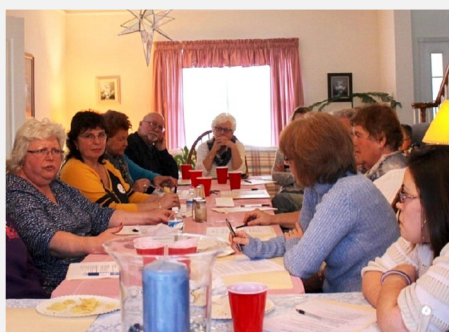
Soup Bowl Planning Get Together