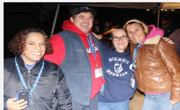
Rivalry Game Bon Fire