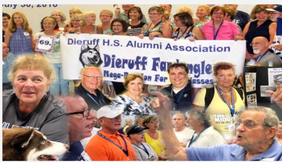
4th Annual Fandangle