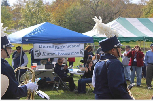
5th Annual Tailgate