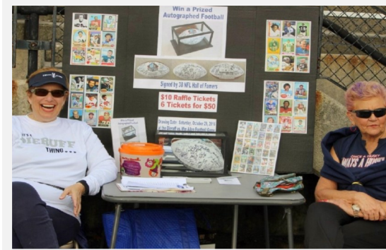
Scholarship Fund Raffle: HOF Autographed Football