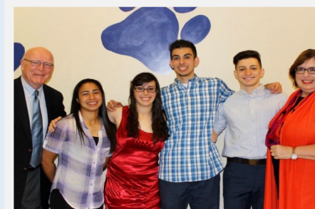
Alumni Spirit Scholarship Award