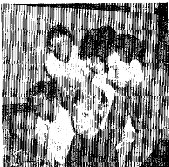
In the Newspaper Office