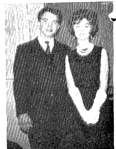
Before the Prom