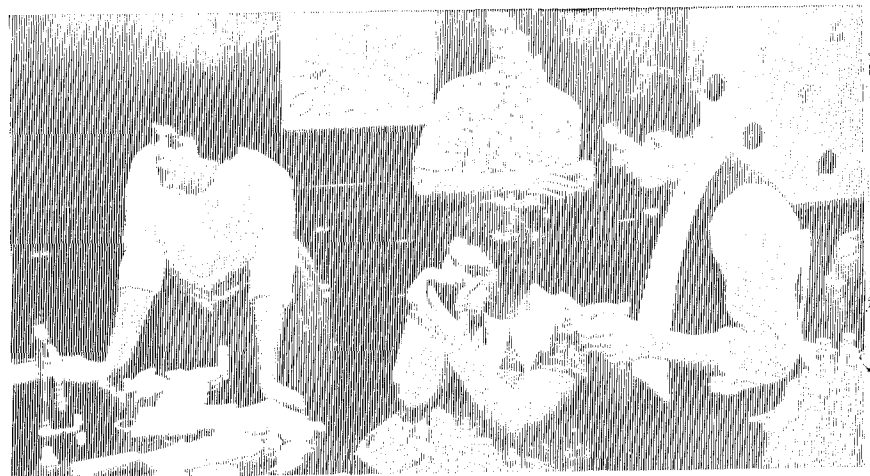
Preparing for "Professor, How Could You?"