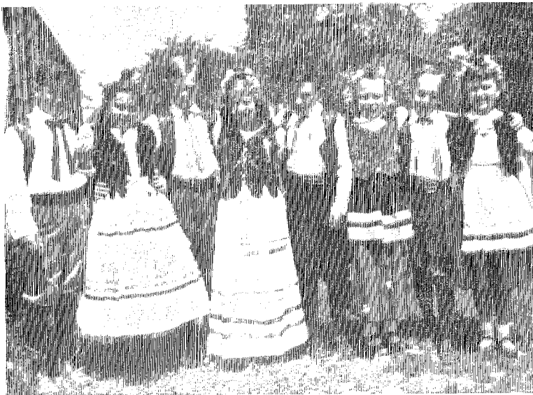
Dancing Styles Have Sure Changed