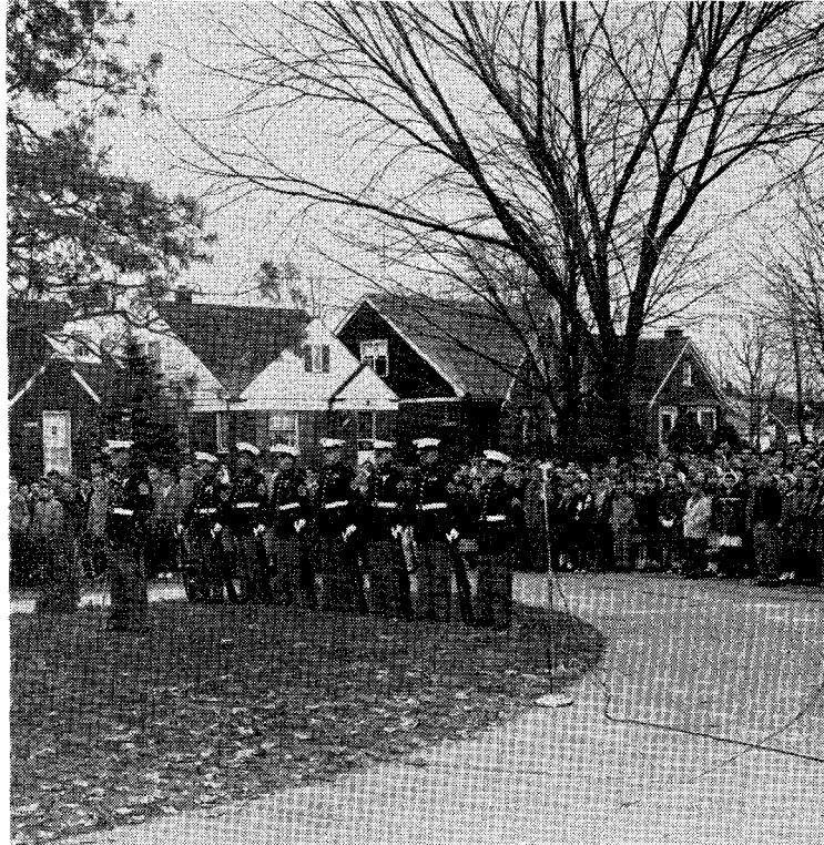
This familiar scene will be repeated on Monday, November 11, in front of the Lowrey flag pole.