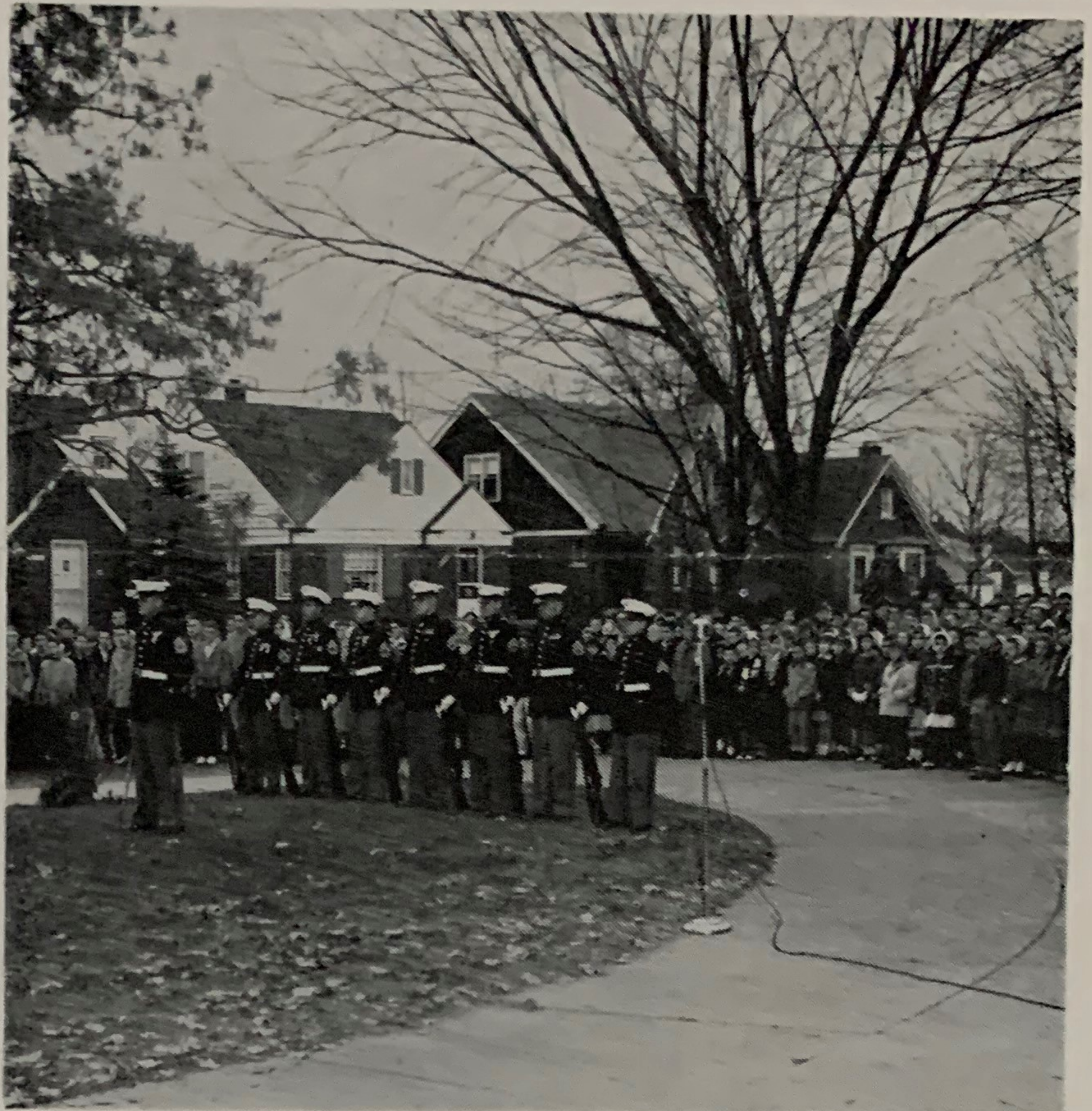
This familiar scene was repeated this morning at 9:00 a.m.