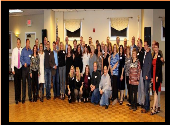
The GHS class of 86 takes time out to pose for a picture