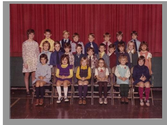
Sacred Heart ROCKS.