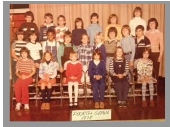
Prospect Street School?