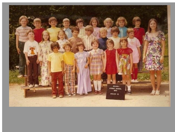
What a great class!