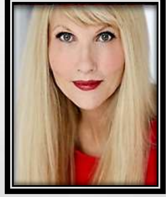
Singing Patriotic Songs