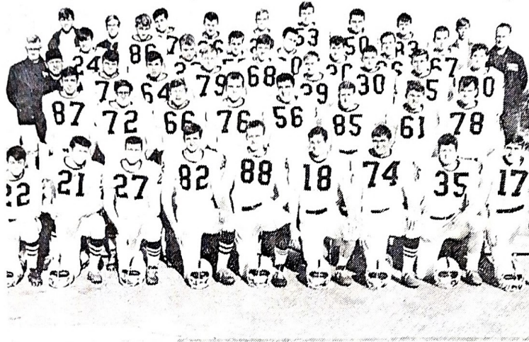
The 1966 Edsel Ford football team looks good—on the field and off.

I'll give you three guesses as to who scored the other Edsel touchdown. Here's a clue . . . His initials are TG.