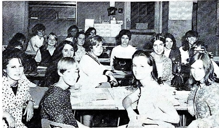
Having completed the first edition of the Bolt, the staff is all smiles.