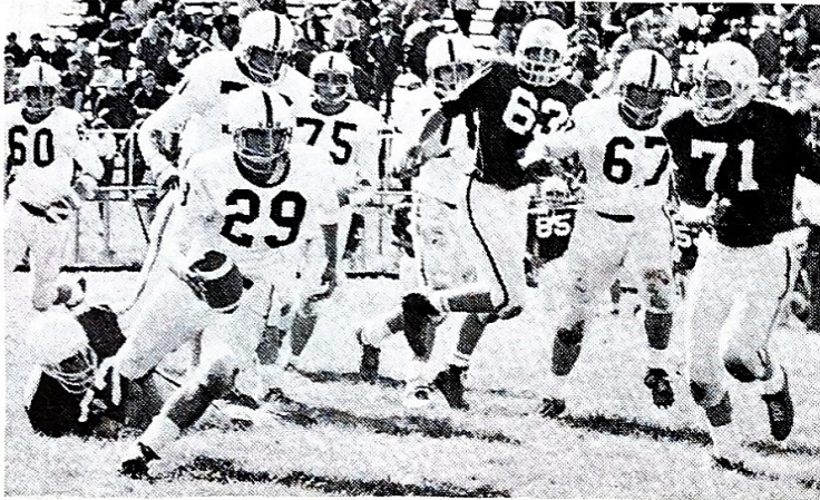
Spirit and action are the elements that make Edsel Ford's football team great.

Last week field hockey officials prepared themselves for the onrush of broken toes, ankles, sticks, fingers, etc., which signify that the fall sport has begun. Yes, G.A.A. is perking again.