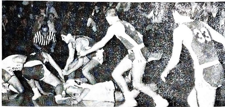
Edsel's J.V.'s show their speed as they scramble for the ball.

Just a week before Edsel's loss to Dearborn, the T-Birds rolled over Wayne 71 to 58.