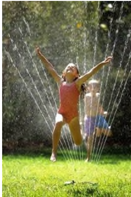
1950's version of a back yard pool.