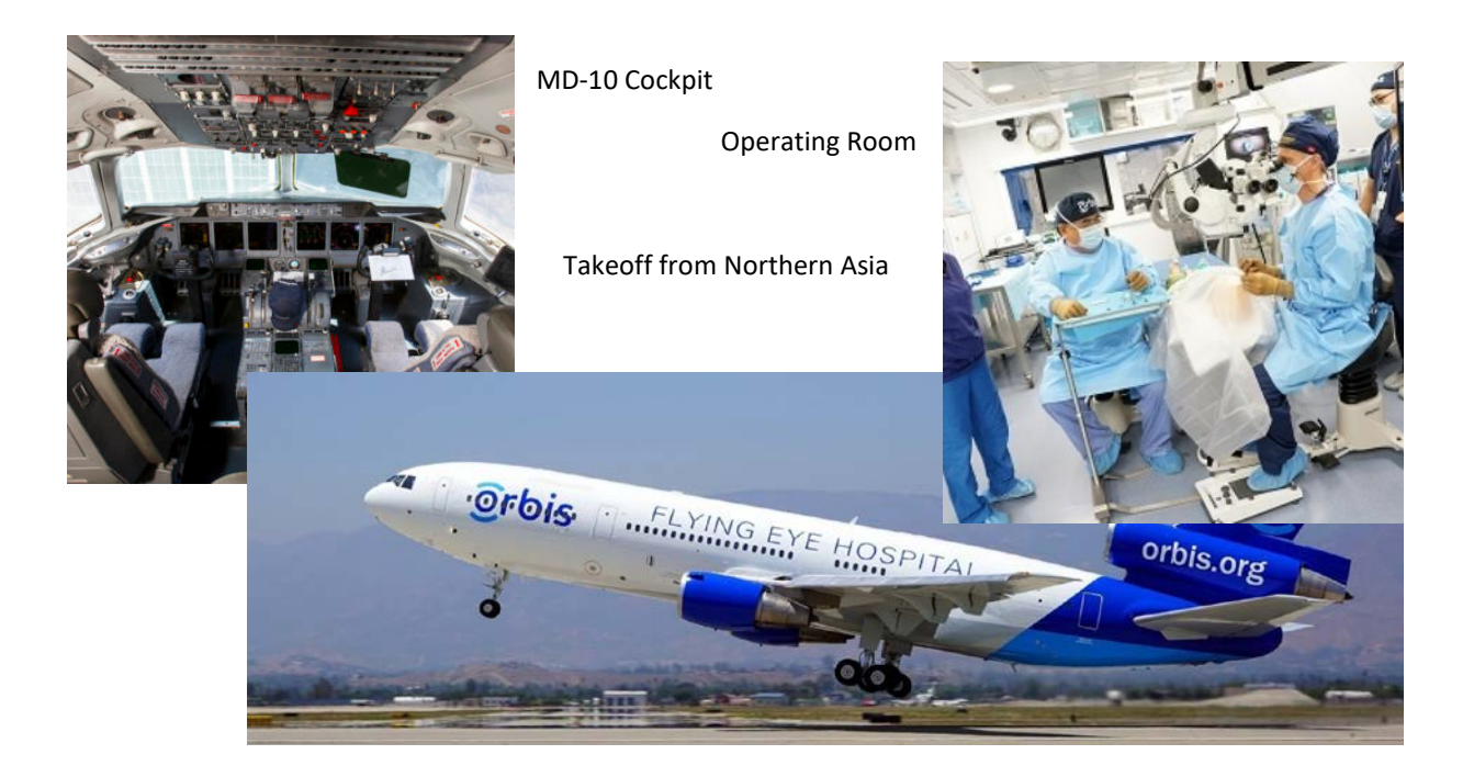
Capt. Harkenen flying the ORBIS Eye Hospital over the world.