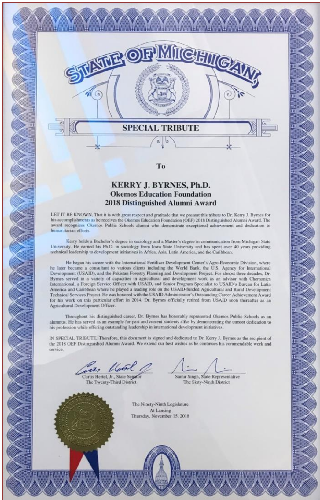
Special Tribute from The State of Michigan