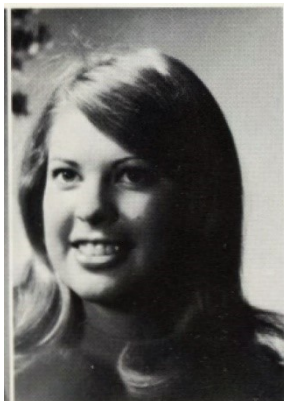
1968 Senior, Okemos High School