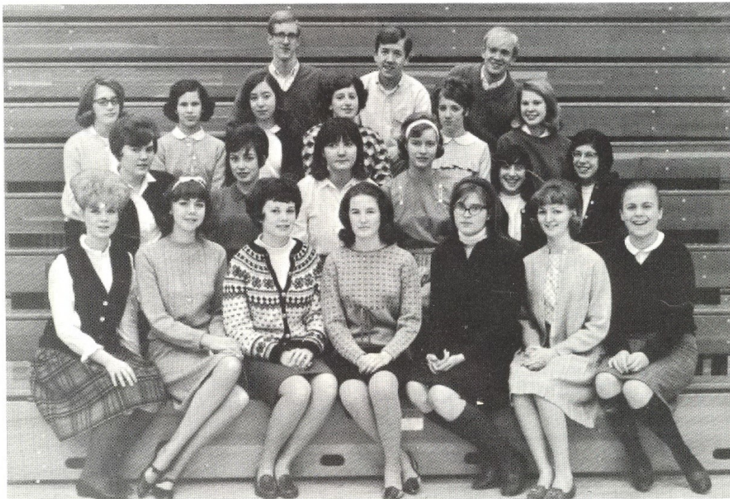
1966 Okemos Tomahawk