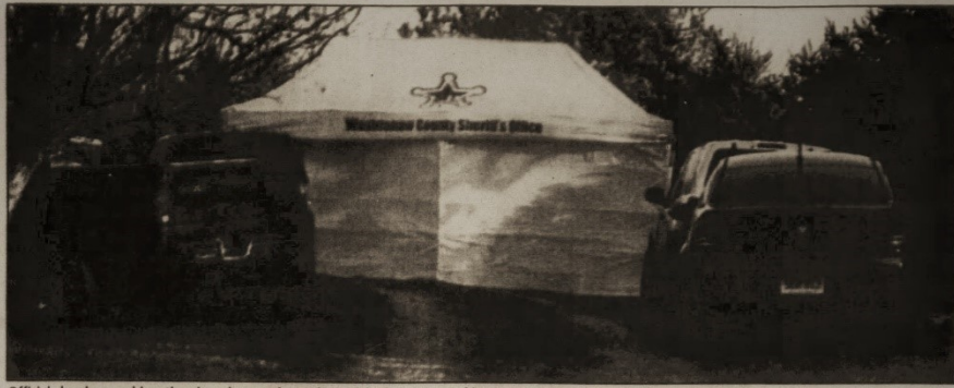
Officials begin searching the site where cadaver dogs picked up scents of human remains in Conway Township.