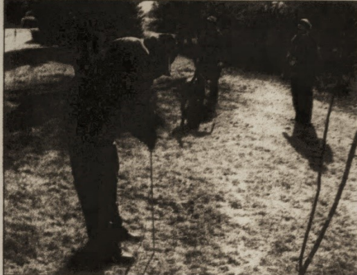
Investigators work in an area near a large tree on private property in Conway Township as cadaver dogs indicate specific locations where human remains may be underground as part of the search for Paige Renkoski.