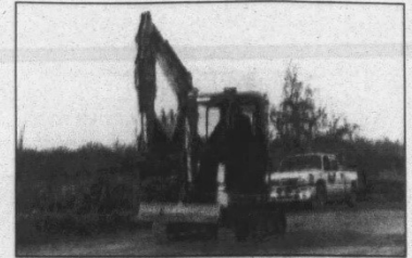
An earthmover approaches the dig site in Friday's search for the remains of Paige Renkoski on Sober Road in Conway Township.