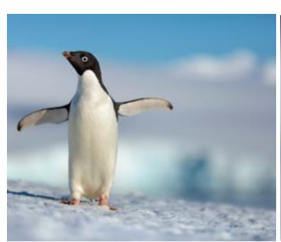
SEE SUDDIES: Penguins (score by Harry Gregson-Williams )

https://www.youtube.com/watch?v=e4LfNLtVQqE