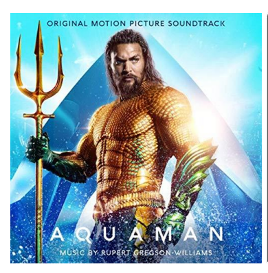
SEA MUTANTS: Aquaman (score by Rupert Gregson-Williams )