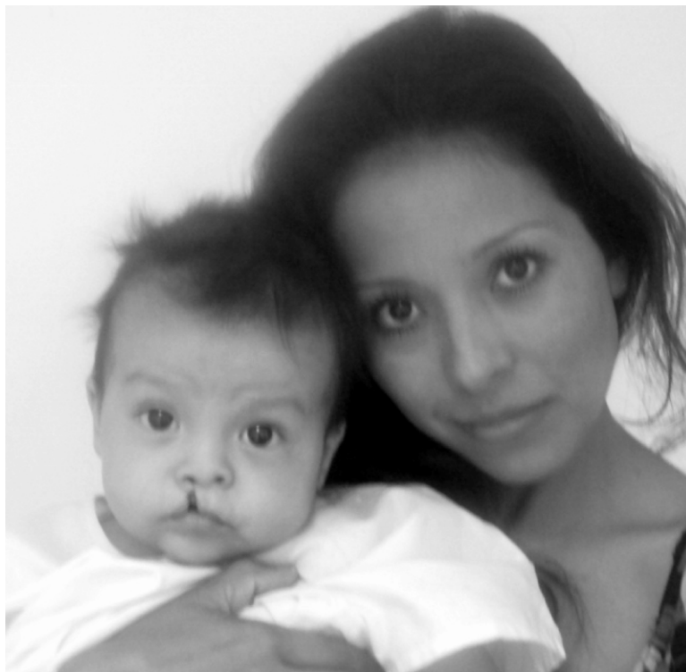
Getting ready for surgery