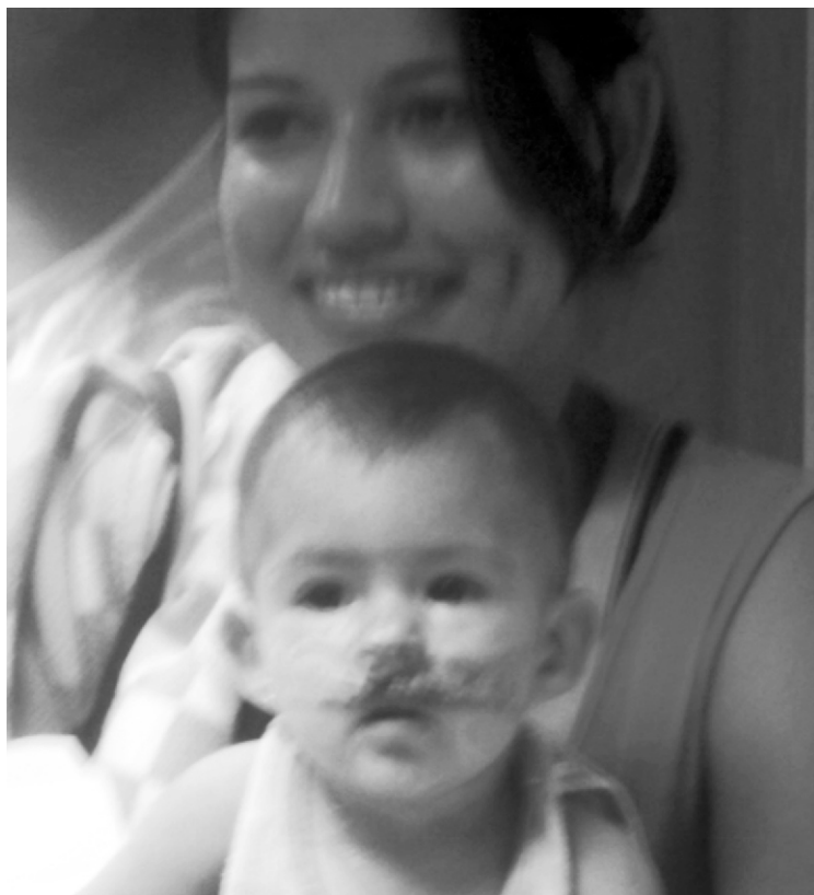
Happy baby and happy parents

approximately 35 to 50 consults are accomplished. This is an ideal time to teach parents and children. Any Spanish Health teaching materials would be appreciated. We'll make the most of it. I Promise!!! THANK YOU!!!