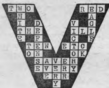
A Victory Quiz