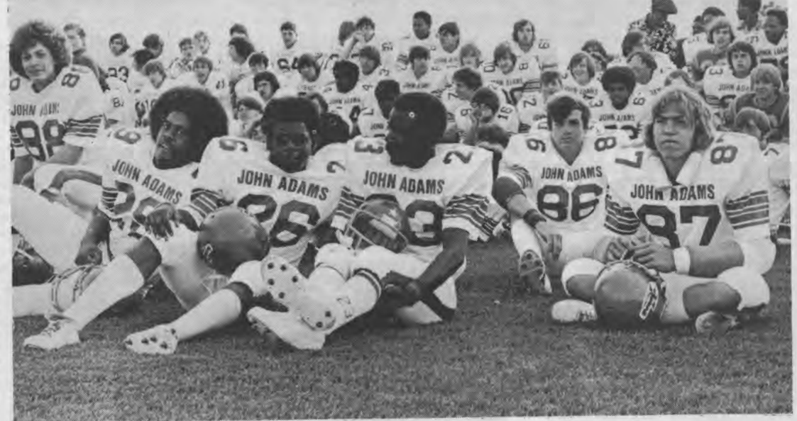
The John Adams High School 1974 Football Squad sits on Jackson Field awaiting their chance to win in the Jamboree.

The overall outlook for this year's season is optimistic with a large number of returning veterans and lettermen at most of the starting positions. The offense, which was last season's weakness, should shine as one of this year's bright spots along with a solid