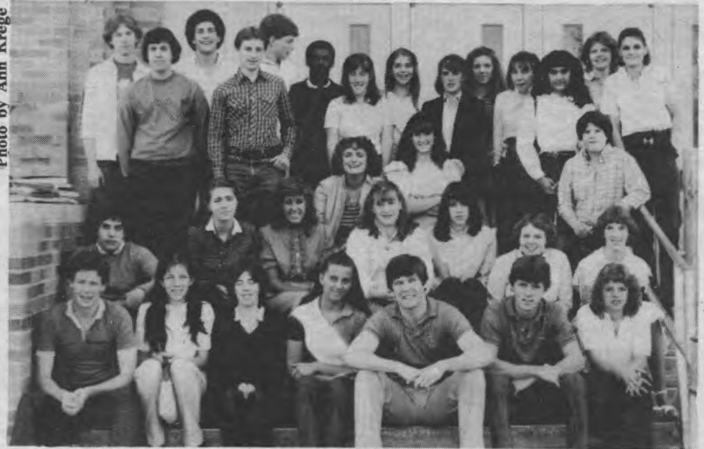
New Album Staff awaits future