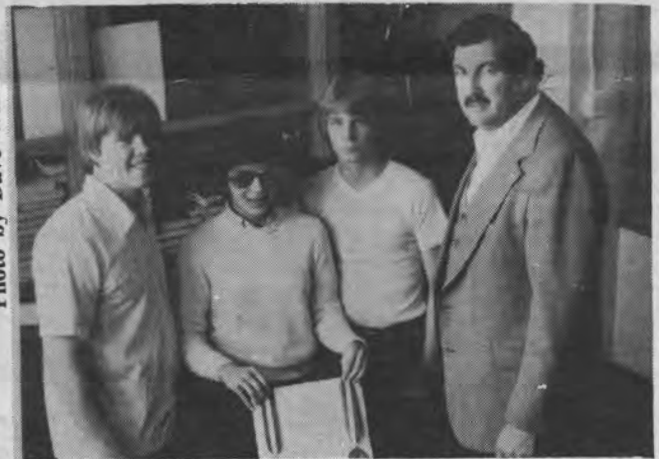
[Above] ICT winners