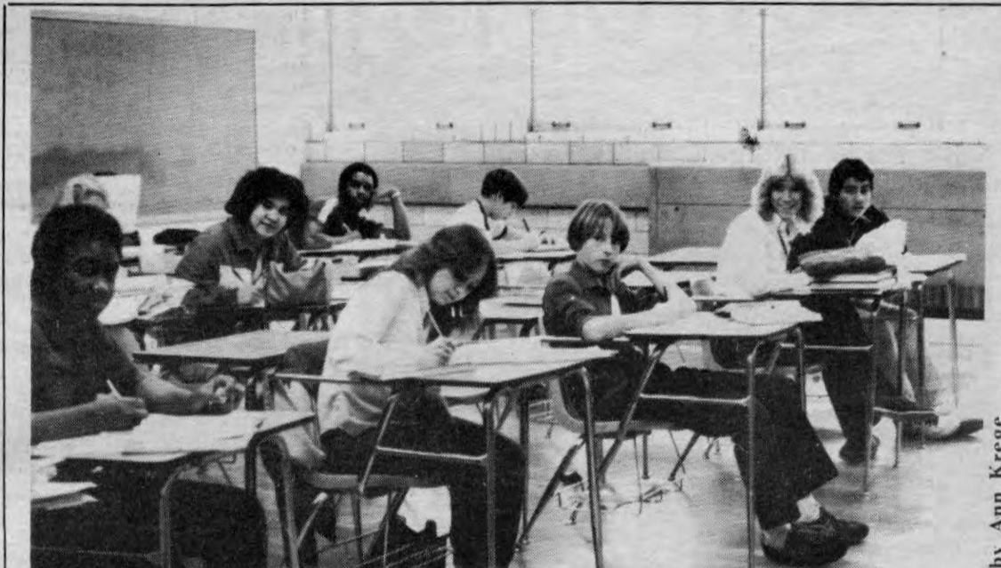
Freshmen unsuccessfully try to apply themselves.

Differences in the nation and John Adams students were obvious with many shows. Fame, the NBC drama about teenagers attending the New York High School for the Performing Arts, was in second place with students but in the weekly Nielson ratings, it is often in the bottom twenty out of the weekly shows that range anywhere from sixty to eighty shows per week depending on the amount of specials and movies. 9 to 5, the ABC spinoff of the 1980 hit movie starring Jane Fonda, Dolly Parton, and Lily Tomlin, is recently a regular to the Nielson Top Ten since it was shifted from its original Thursday night spot to Tuesdays following the popular comedy, Three's Company. 9 to 5 tied at forty-three with only one student behind it. Other series that are weekly hits on the Nielson ratings but flopped on this survey were The Fall Guy (ABC), Three's Company (ABCS), Falcon Crest (CBS), The Love Boat (ABC), The