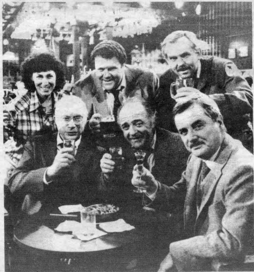
Members of the cast of "Cheers," from left rear, Rhea Perlman, George Wendt and John Ratzenberger, are joined by members of "St. Elsewhere," from left, Norman Lloyd, Ed Flanders, and William Daniels, as the good doctors visited the "Cheers" set during filming of an upcoming episode of "St. Elsewhere."

Show challenging the likes of T.J. Hooker and Hardcastle & McCormick it is not hard to see why.