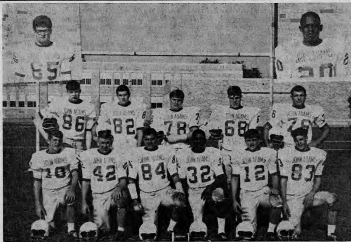
Thirteen returning lettermen to head Varsity Football Team in Season Opener.