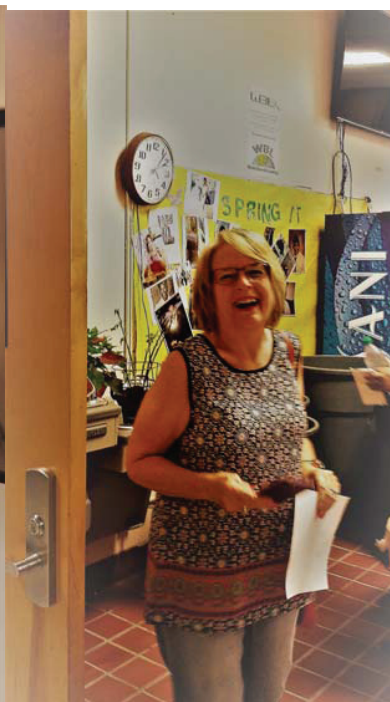
Old CPHS Building During the 2017CPHS Open House