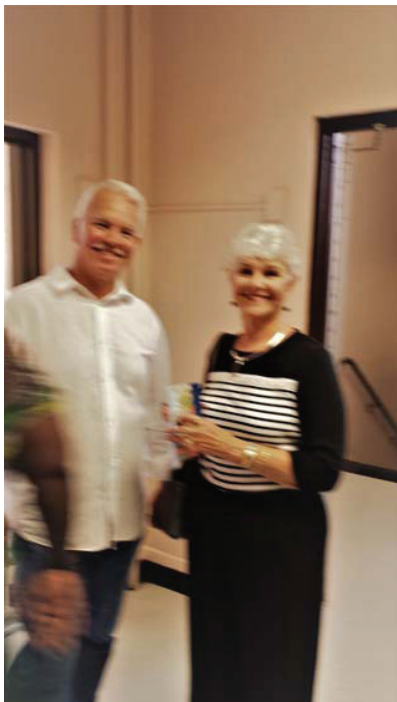
Building During the 2017 CPHS 2017 Open House