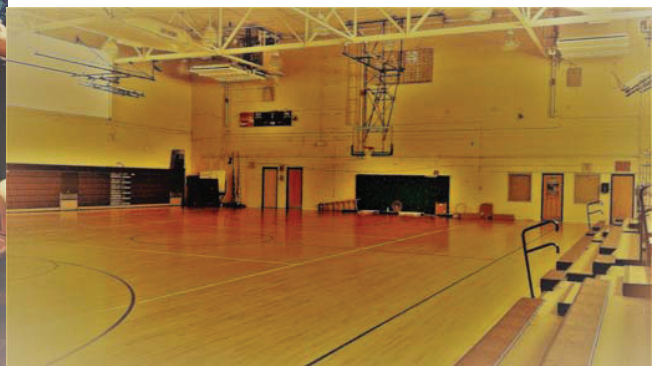
CPHS Gymnasium at the 2017 CPHS Open House