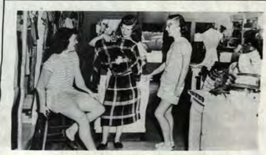
The High-School Crowd Shops at Schueller's

Back-to-school or not, you'll want a DORIS DODSON to complete your fall wardrobe.