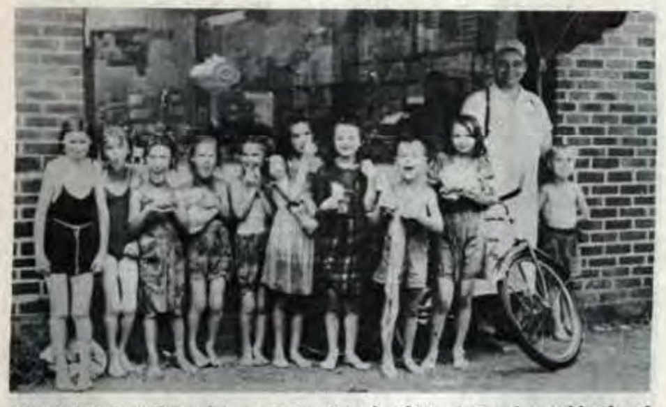
Caught in a sudden heavy rain recently this group of neighborhood small try dashed to shelter under the awning of Alward's Market on Wilcox street.