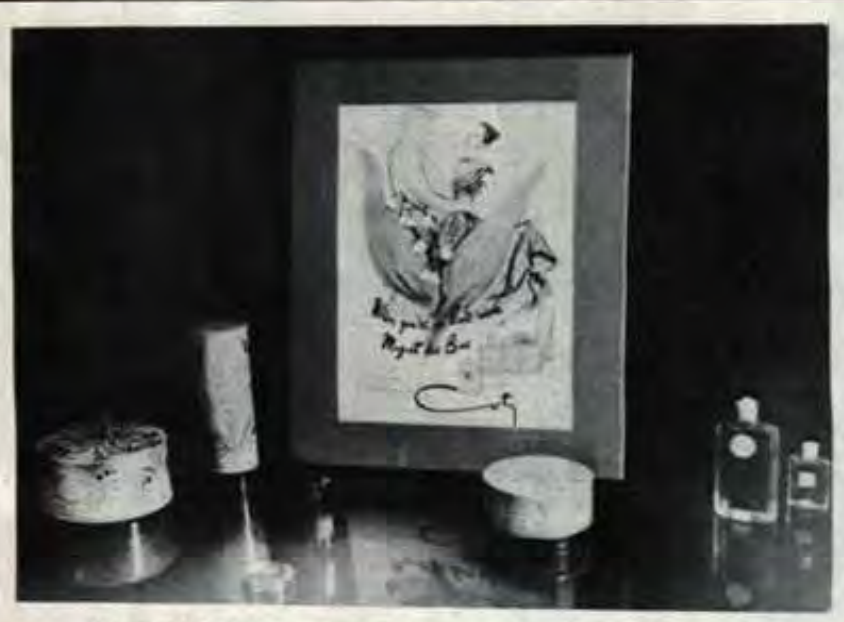
HEADQUARTERS for FINE COSMETICS ALL YOUR FAVORITES