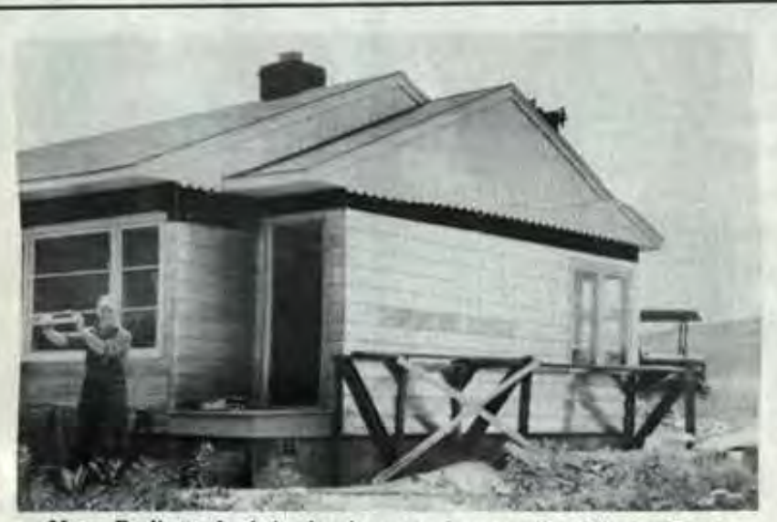
Morse Darling unloads lumber for a new house on East Tienken Road.

Yes, here's another NOWELS home under construction. Because of our years of building experience, we can tell you short cuts that will save you time, money and materials. Bring your building plans in and let us help you.