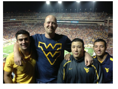
Cincy/Dayton Mountaineers inside Texas Stadium

The large contingent of Mountaineer fans could be heard not only on Sixth Street, but throughout the 100,000+ seat stadium before, during, and especially after the game. As the game ended, I'll never forget celebrating with the fans and hearing the famous "Let's go Mountaineers" chant as it rang out in Austin. We look forward to seeing other Big XII venues, learning about the traditions of the member schools, and meeting and sharing a beverage or two with their fans. Even though we will keep the tradition alive by attending more away games in the future, our 2012 trip to Austin was one for the ages and will be hard to top.