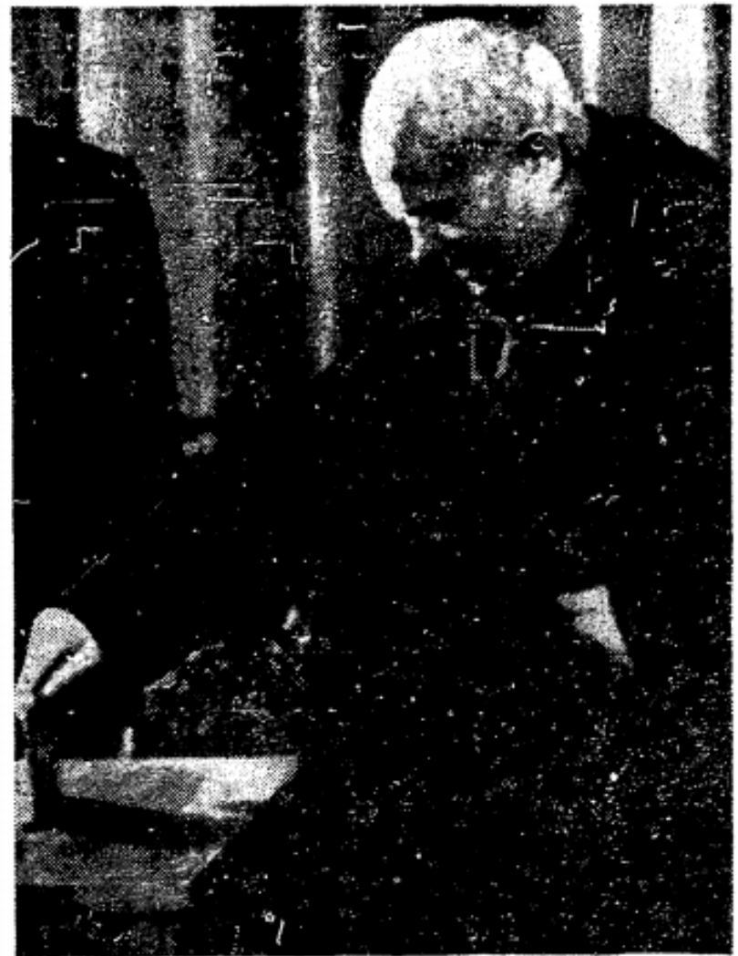
GOING THROUGH MOTIONS —Soviet Premier Nikita Khrushchev casts ballot in Moscow to lead some 137,000,000 Russian citizens to polls to vote for members of supreme soviet. As almost all Red voters do, Khrushchev dropped ballot with names of unopposed candidates into box without marking a 'nyet.' Results are expected to be announced tomorrow.

They bring the College of Cardinals to an all-time high of 87 members. The new cardinals are from Ireland, Italy, Peru, Chile, Porgugal, Belgium, Spain and Syria.