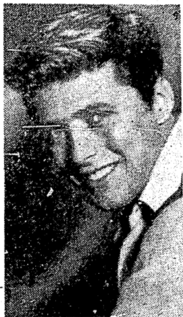
'KOOKIE' WEDS —Edd Byrnes, of the "77 Sunset Strip" series on TV, was married to actress Asa Maynor in Beverly Hills, Calif. They are on a secret honeymoon.