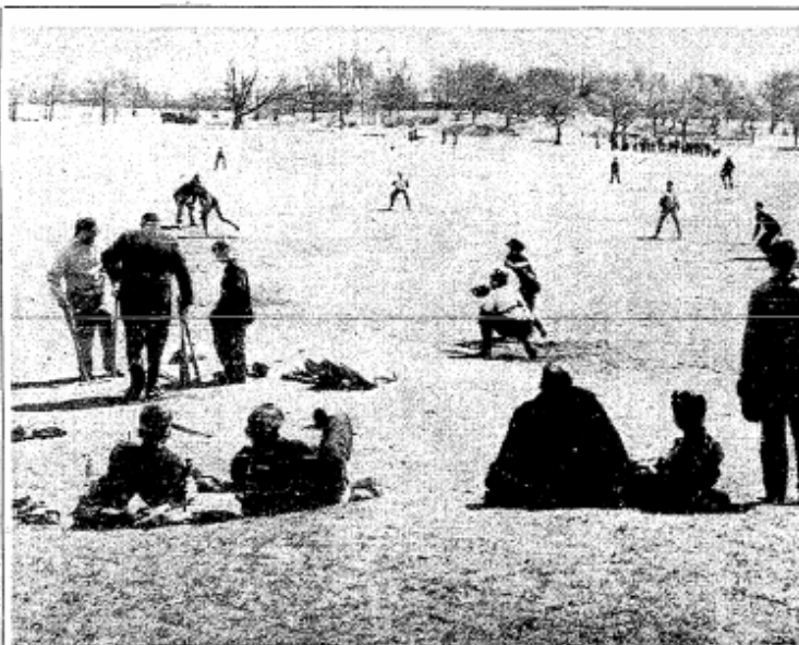
BALL, BAT AND BOYS—Put them together on a fine day in spring in Lincoln Park, Jersey City, and the result is baseball—and fun.

"IF THIS COMES off it would be one of the biggest things that ever happened to Jersey City,"