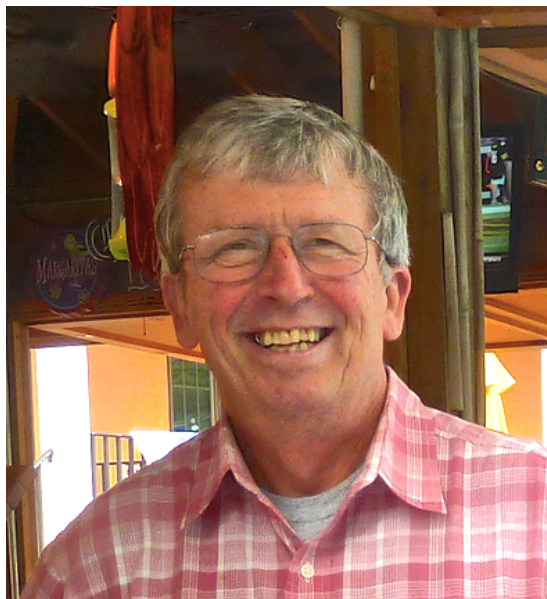
At the Golf Outing Last Year