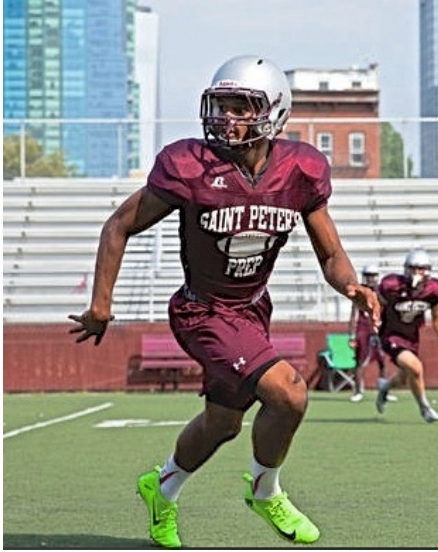
Minkah Fitzpatrick CB/WR/RB