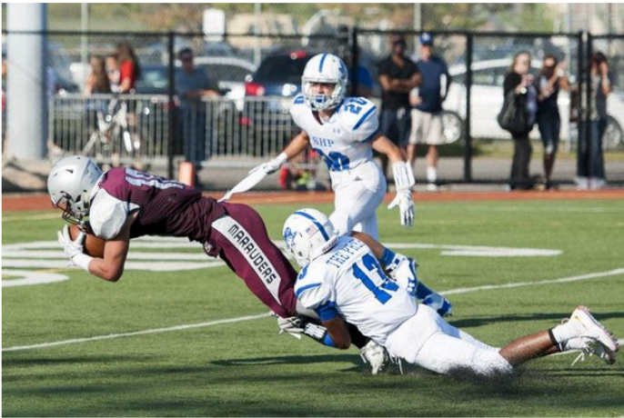
St. Peter's Prep is 2-1 on the season following a victory over Seton Hall Prep.