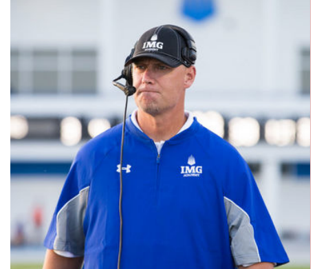
IMG Academy, coached by former Florida State Heisman Trophy winning quarterback Chris Weinke