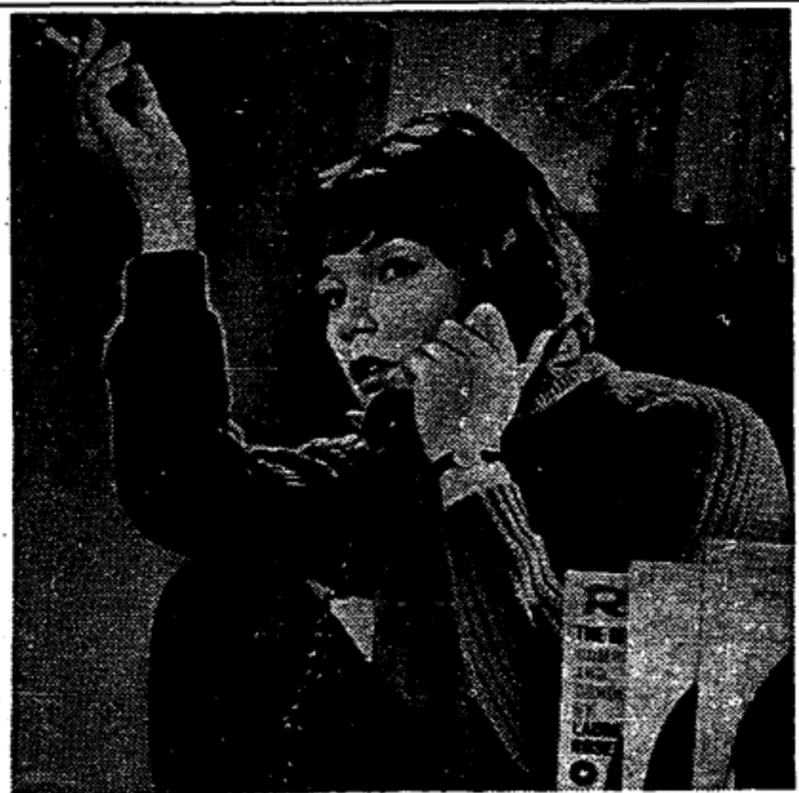
COMING TO LOEW'S — Shirley MacLaine, together with Robert Mitchum, co-star in the delightful comedy-drama 'Two for the Seesaw' starting Wednesday at Loew's Jersey City Theatre.

Roberta Peters and Jerome Hines with Carla Fracci, prima ballerina of La Scala Opera in Milan.