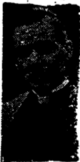
Fulton J. Sheen more stubborn.

"Hardened criminal" is a phrase one often hears, but rarely the expression "hardening of the heart." Psychology has not touched upon this phenomenon, which is more general than is suspected, and which explains, to a great extent, juvenile delinquency, violence, impiety and the like.