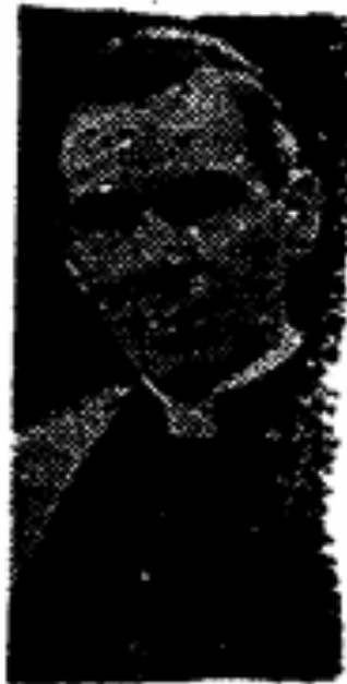
Fulton J. Sheen

Every human being at his birth has everything to learn. His mind is a kind of a blank slate on which truths can be written. How much he will learn will depend upon: 1) how clean he keeps his slate, and 2) the nobility and wisdom of his teachers.