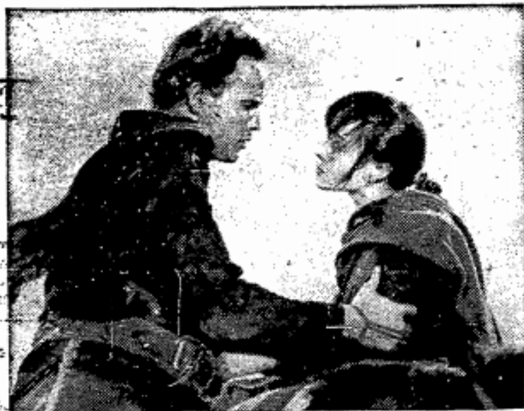
STANLEY FEATURE — Marlon Brando and newcomer Pina Pellicer are starred in 'One Eyed Jacks', continuing for a second week at the Stanley Theater, Jersey City. Karl Malden and Katy Jurado are also featured in one of the year's most exciting films.