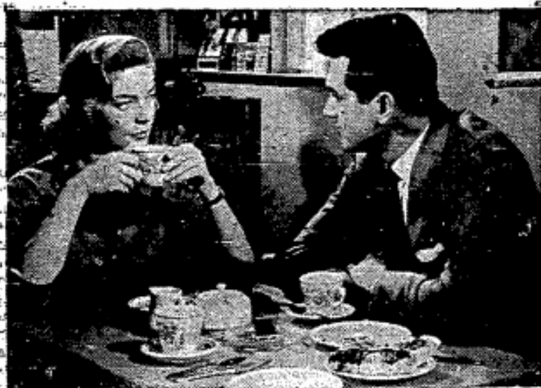
LOEW'S ATTRACTIONS — Loew's Theater, Jersey City, is presenting an all in-color show beginning tomorrow. 'Written on the Wind' stars Rock Hudson, Lauren Bacall, Robert Stack and Dorothy Malone. Companion feature is 'Imitation of Life' with Lana Turner, Sandra Dee and John Gavin.

NOW BEING INSTALLED OUR NEW MODERN CARRIER AIR- CONDITION SYSTEM FOR YOUR SUMMER COMFORT