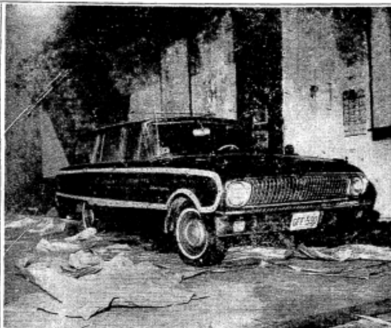
HIJACKERS? — FBI agents say this station wagon was used by hijackers to take stolen clothing to a Bayonne garage.