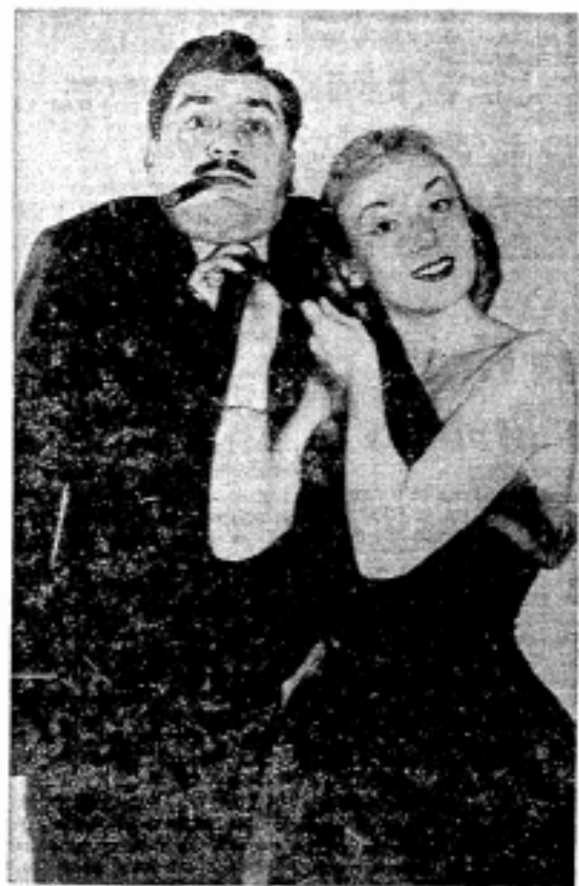
PARTED BY DEATH — Ernie Kovacs, shown with his wife, comedienne Edie Adams, in a TV rehearsal, was killed today when station wagon he was driving struck a pole in Los Angeles. Miss Adams had arrived home in another auto after a party they had attended, a few minutes before fatal accident.

THEY SAID his white station wagon was about 100 yards from the Beverly Hilton Hotel when it hit the pole. All that was left after the body was removed, officers said, was blood and one of Kovacs' big cigars.