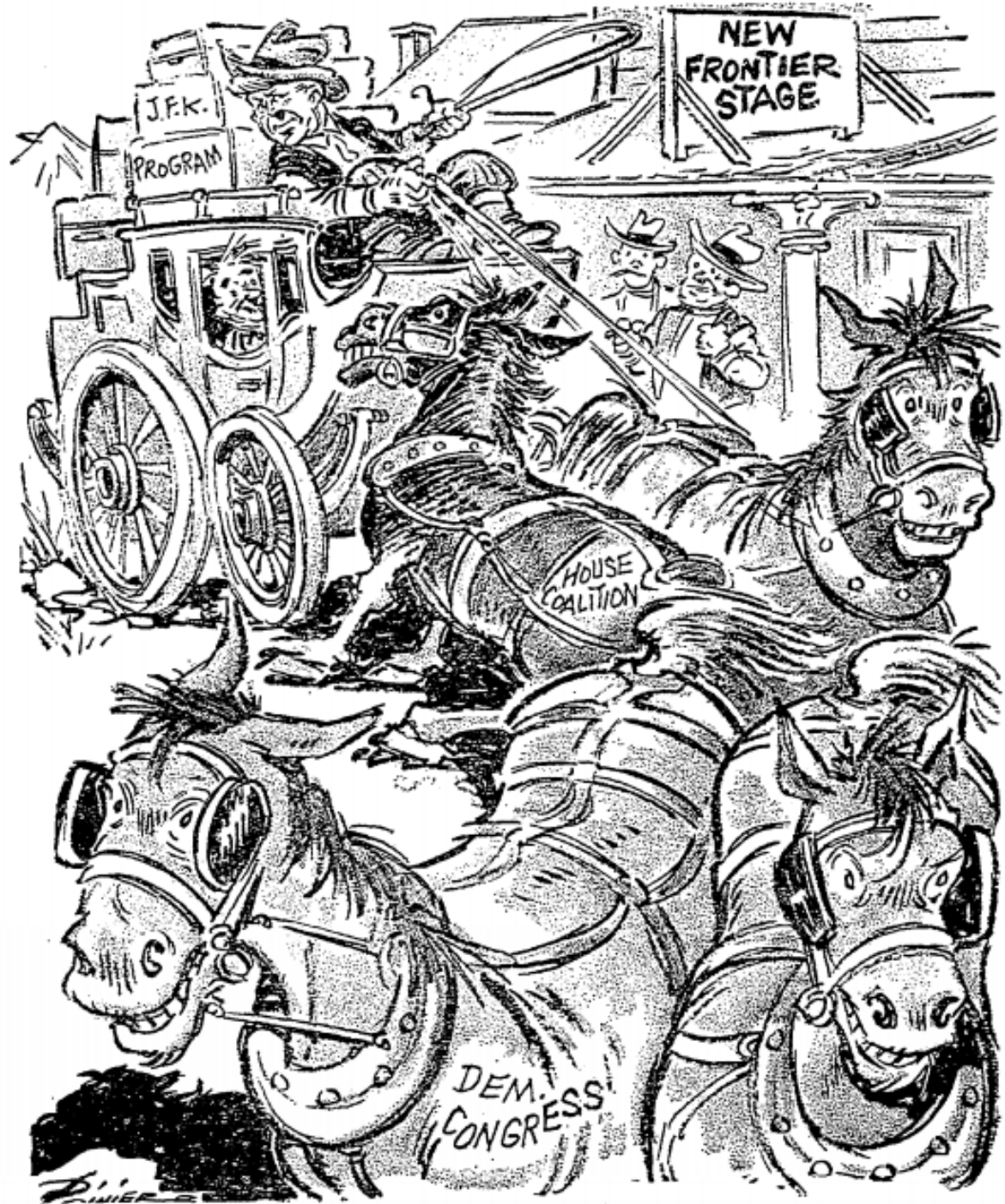
The Political Whirl