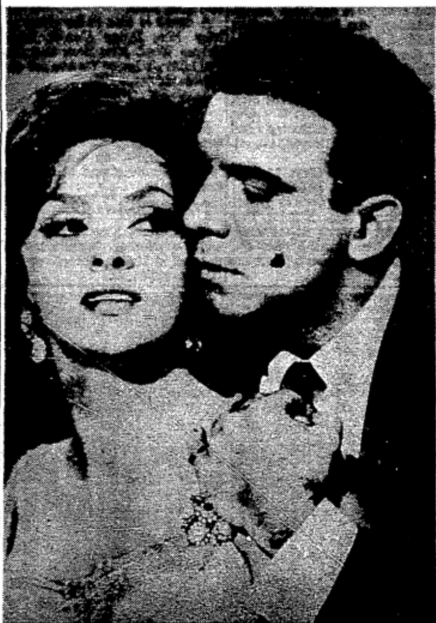
NEXT AT LOEW'S —Gina Lollobrigida and Anthony Franciosa share starring roles, together with Ernest Borgnine in 'Go Naked In the World,' in color, starting Wednesday at Loew's Jersey City Theatre. On the same program is the dramatic film 'Riff-Raff'.