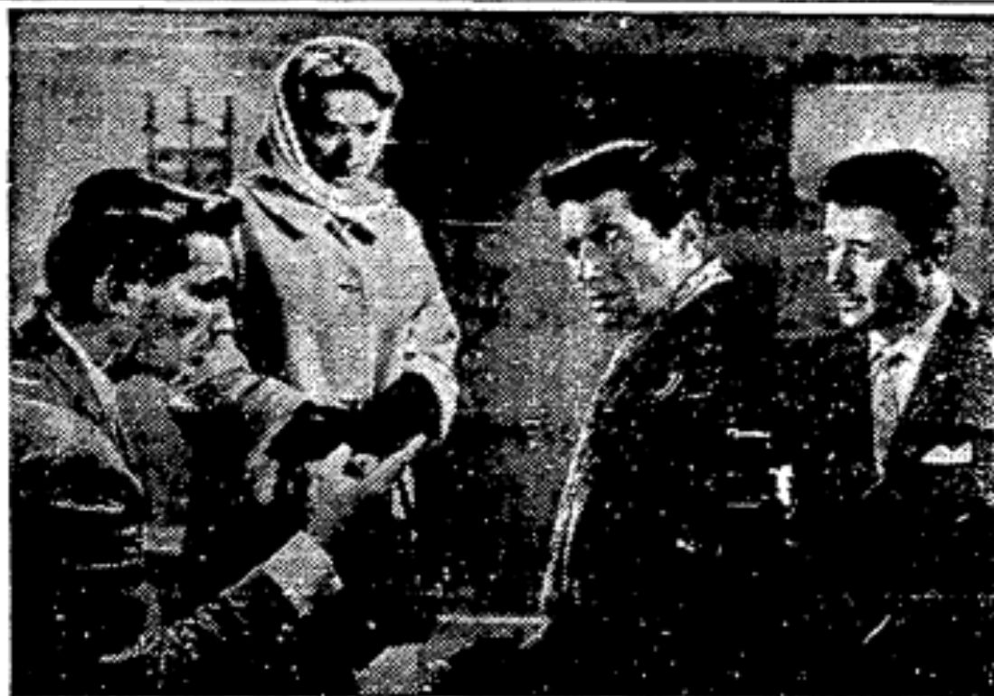
STANLEY FEATURE —Four top stars, (left to right) Jack Kelly, Angie Dickinson, Efrem Zimbalist Jr., and Don Amache are shown in a scene from 'A Fever In The Blood' opening Wednesday at the Stanley Theatre, Journal Square.