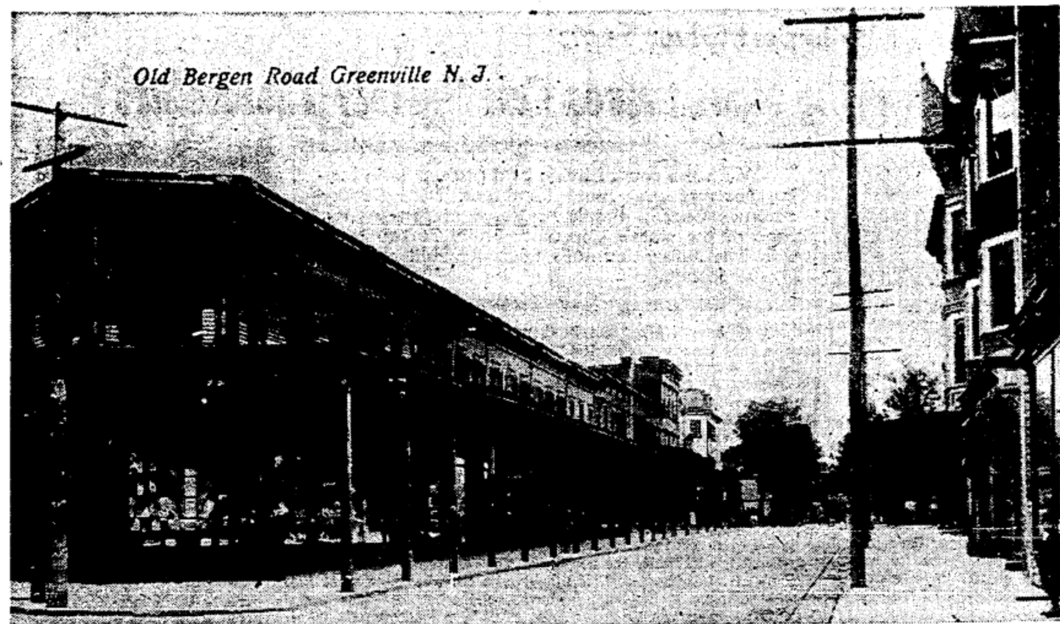
Old Bergen Road Greenville N. J.

DO YOU REMEMBER? — This postcard photograph shows what Old Bergen Road in Jersey City looked