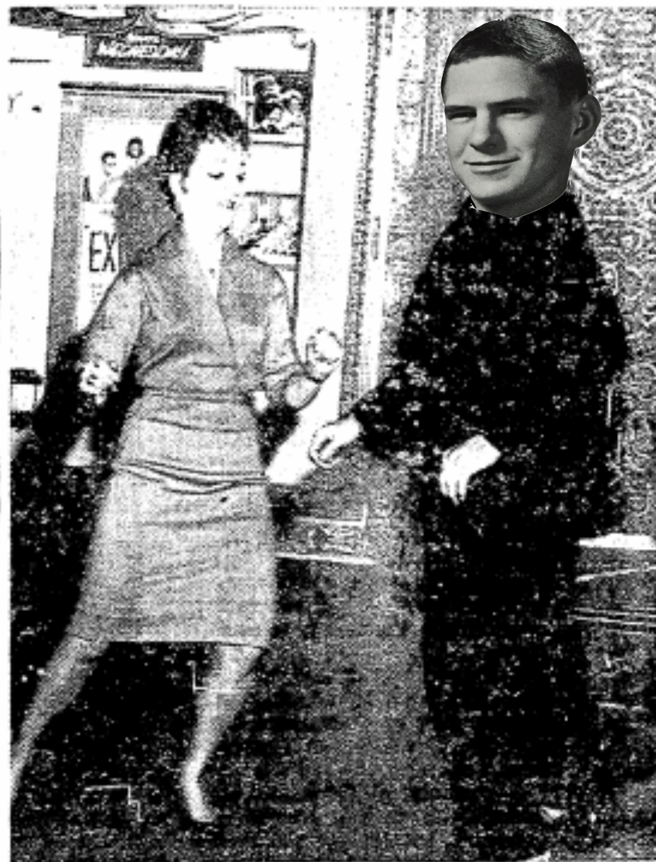
TWISTING AT LOEW'S —To keep in the spirit of the Chubby Checker picture "Twist Around The Clock" now at Loew's Jersey City Theatre, the management had several instructors of a dance studio, entertain and give instructions in the lobby. The dancers will appear again during the run of the film.