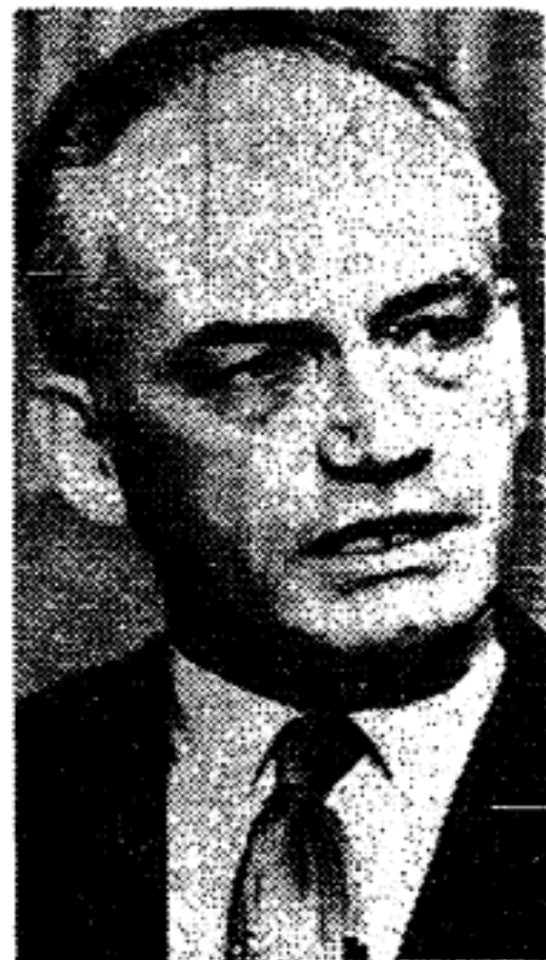
SEN. BARRY GOLDWATER

"I suggest that it would be reassuring to the American people, now that President Kennedy has demonstrated the worth of a policy of action based on American strength, to rid his administration of those who have consistently urged a soft policy toward communism, both in Cuba and else-